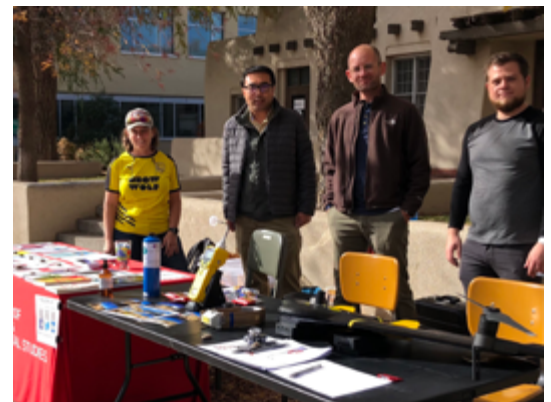
Geography Awareness Week 2021