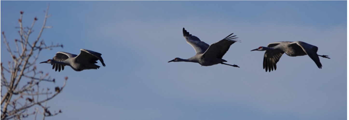
Sandhill Cranes flying to the river for the night