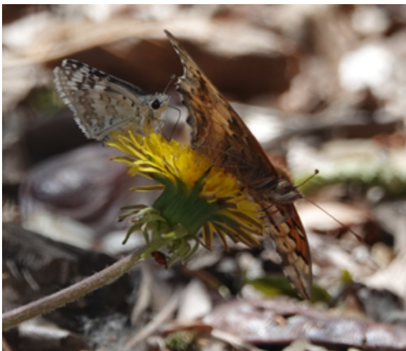
Variegated fritillary and Checkered Skipper on a dandelion in a backyard refuge.

If you would like to contribute articles, updates, and/or photographs (with credit line & caption), email them to unmGESalumni@gmail.com