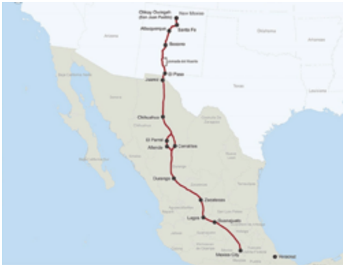
El Camino Real de Tierra Adentro

Agricultural Connections Along El Camino Real